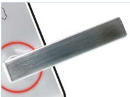
Aesthetic Lever Handle Design