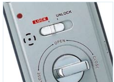
Internal lock/unlock function