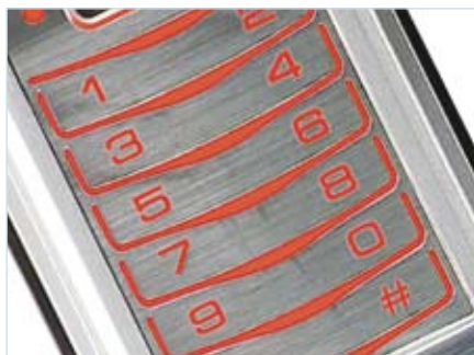
Stylish Electronic Keypad - illuminated