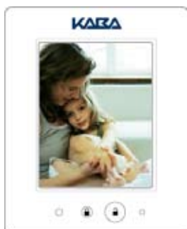
Wireless Door Release (remote control)