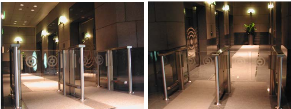
Lift lobby entrance