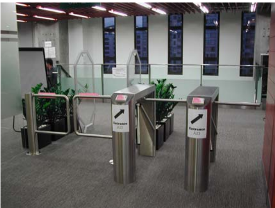
Entrance in library