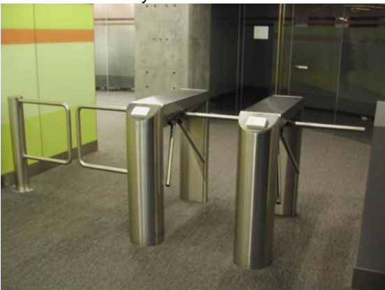
Entrance in computer centre