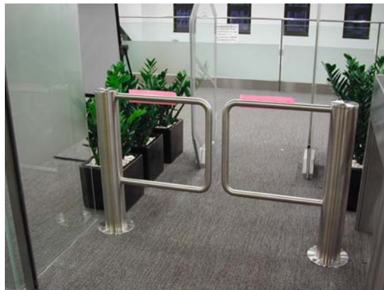
Exit in library