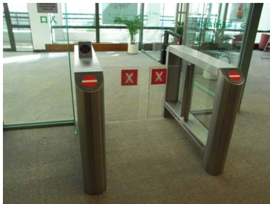
Entrance in library