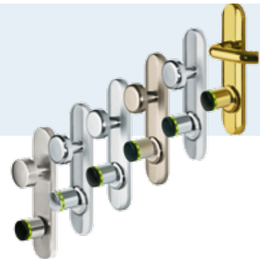
Various finishes and functions are available