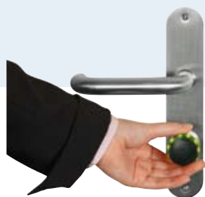
Intelligent knob - keyless door opening

Has access for 2400 media per cylinder, without time functions (standard version).